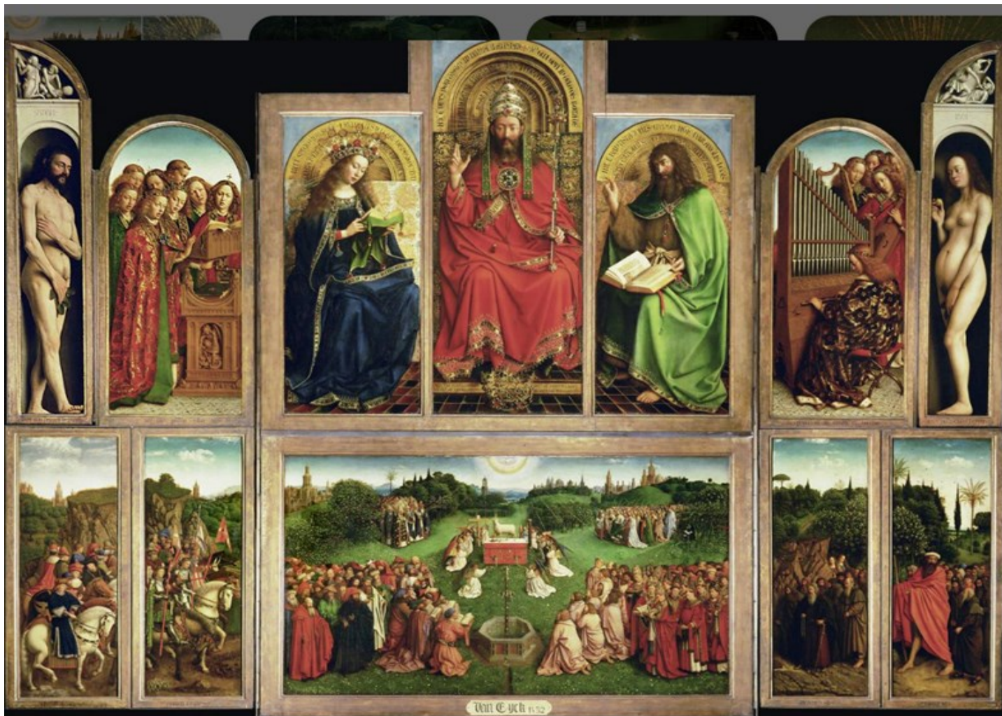
The Adoration of the Mystic Lamb by van Eyck depicting heaven.

Our eternal home, the true land in which we are destined to remain forever, where we will see God. Did you know that Pope Benedict XII defined as a dogma of faith that the souls of the saints actually see God? That this vision is: “intuitive, face to face, without the mediation of any creature... the divine essence is seen immediately, openly, clearly... the elect enjoy this vision of the divine essence, and they are truly blessed and have eternal life and rest” (Bull Benedictus Deus). Theological terminology here seeks to exhaust the resources of human language, but it can go no further. The infused virtue of faith alone can lead to a deeper understanding of what those words mean, but in this life, there will always be a veil. Only after death will the veil be lifted, and our beloved God will be seen face to face