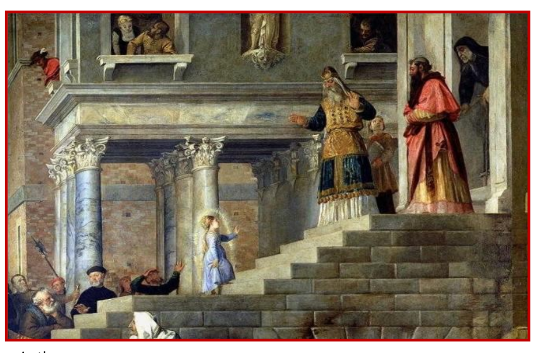
"The Presentation of the Virgin Mary" by Titian

description of her presentation in the Temple, which mirrors the apocryphal gospel accounts: