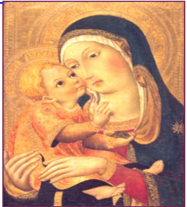
Madonna and Child from the Robert Lehman Collection, Metropolitan Museum of Art.